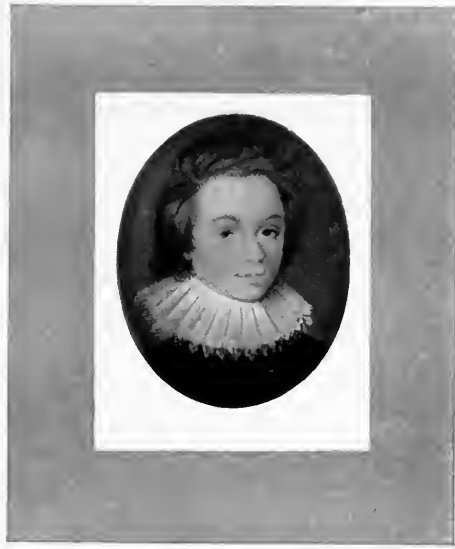
A SON OF SIR KENELM DIGBY BY ISAAC OLIVER (1632)